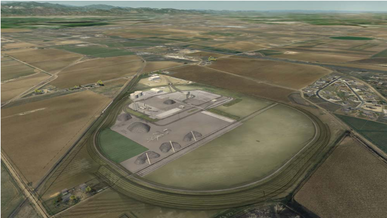
Aerial View from Northeast of the Site Looking Southwest