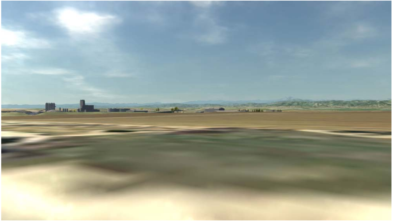
From Viewpoint “D” Looking Southwest